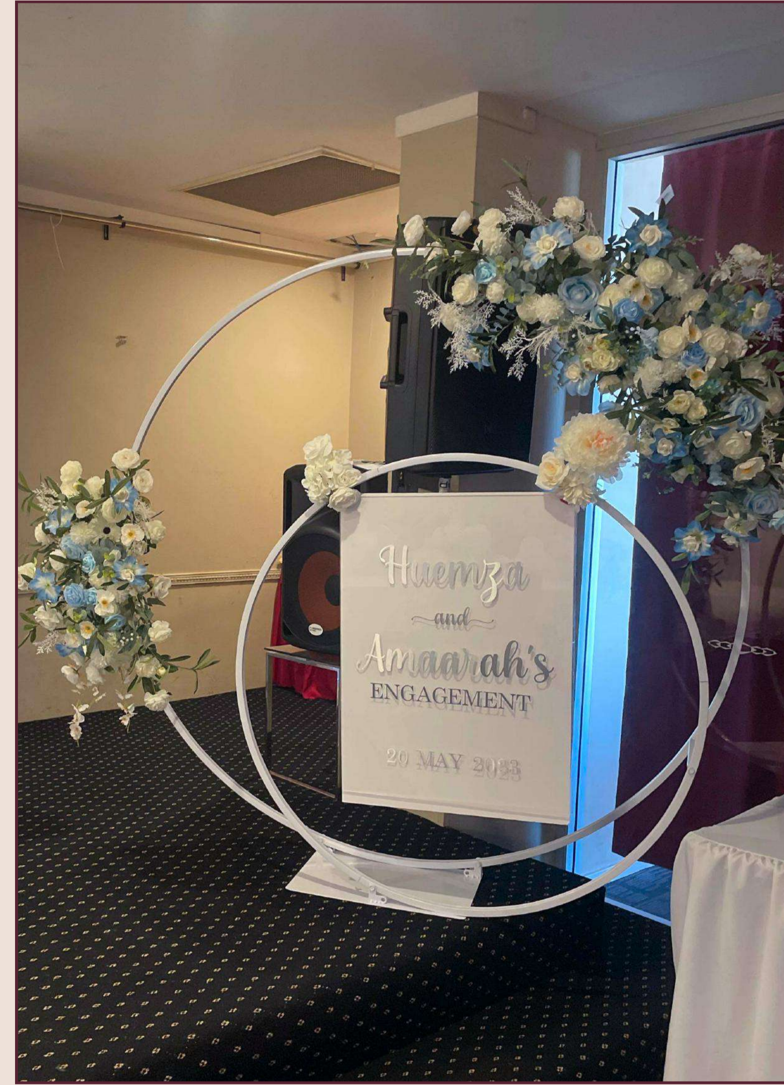
WHITE ASYMMETRICAL DOUBLE RING