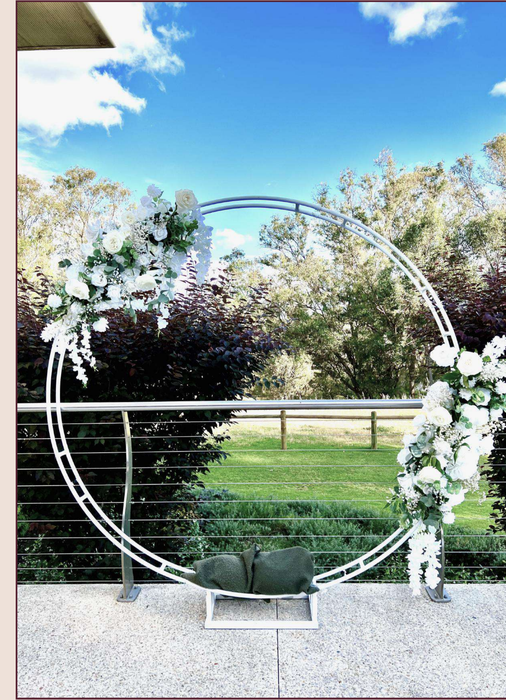
WHITE ROUND DOUBLE HOOP