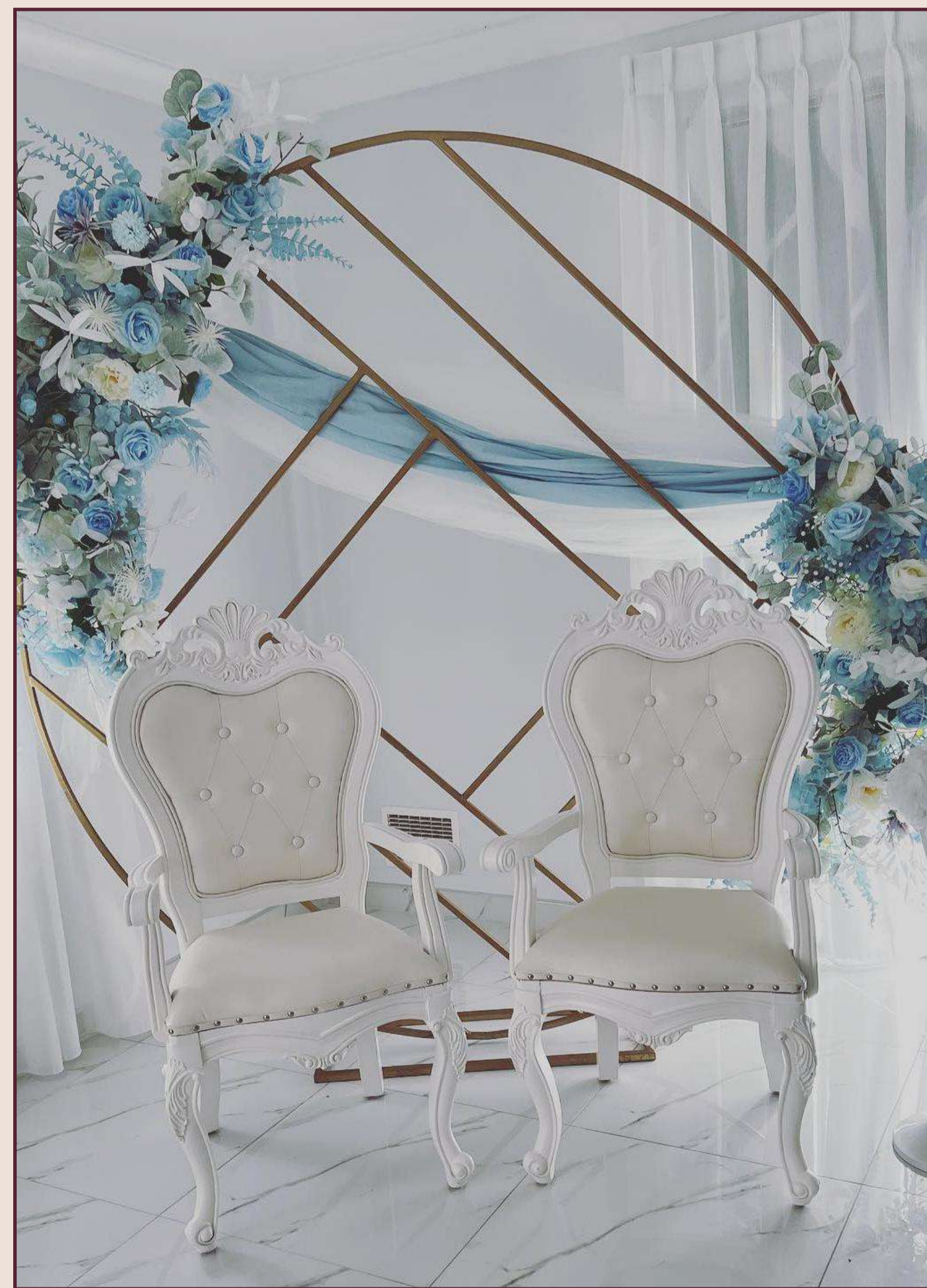
GOLD GEOMETRICAL ROUND